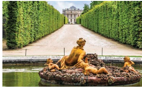
Above: Seine River, Paris | Below: Versailles Palace garden