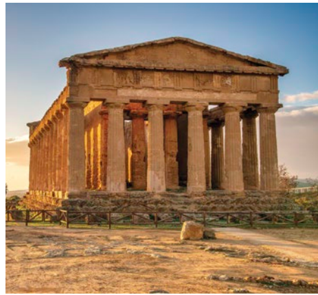
Temple of Concordia

"The Burial of St. Lucy" before continuing to Ortygia, Syracuse's atmospheric island old town. Admire its baroque beauty and go inside the splendid Cathedral of Syracuse.