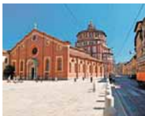
Santa Maria delle Grazie

Church and Dominican Convent of Santa Maria delle Grazie with "The Last Supper" by Leonardo da Vinci