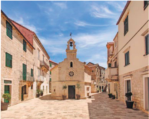
Stari Grad, Hvar

Vrboska & Winery. Learn about the local viticulture at a family winery and enjoy a guided tasting of the family's legendary wines. Continue to the fishing town of Vrboska with fig-covered courtyards and pretty alleyways.