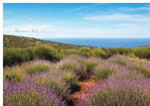
Lavender farm, Hvar