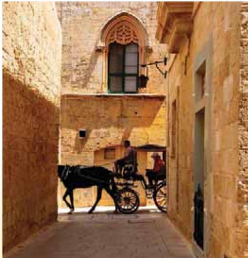
Old town, Mdina