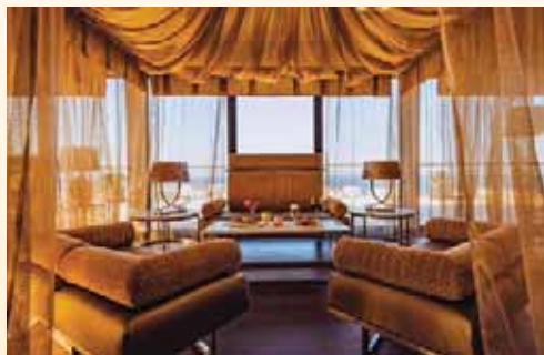
AX The Palace | Siema