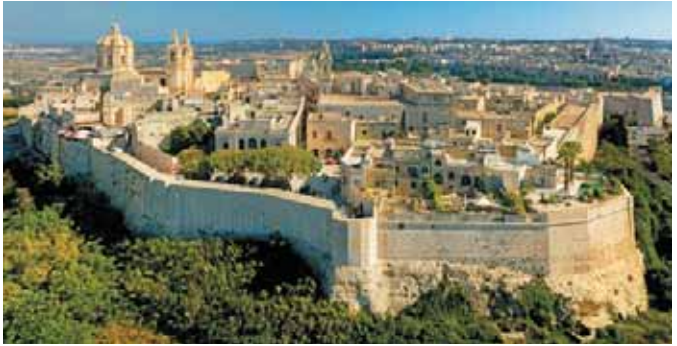
Mdina, walled ancient capital of Malta