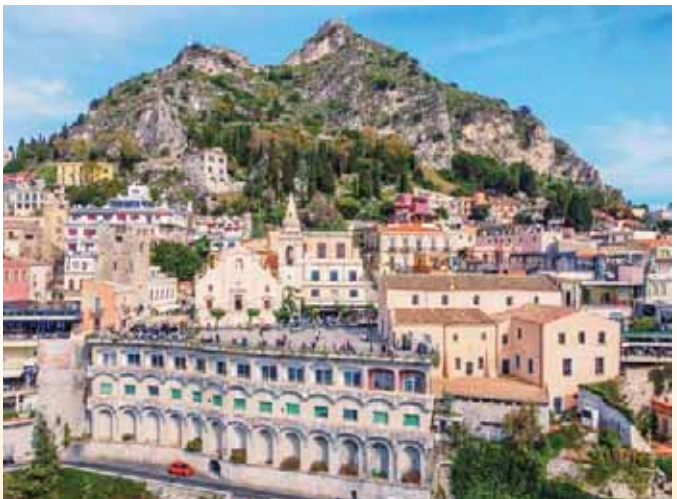
Piazza IX Aprile, Taormina