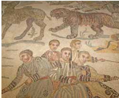
Detail of mosaics, Villa Romana del Casale

this fashionable hillside resort town and see its medieval landmarks. Visit the famous Greek theater that offers stellar vistas of the Ionian Sea and majestic Mount Etna in the distance.