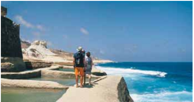
Salt pans along the shore of Xwejni Bay