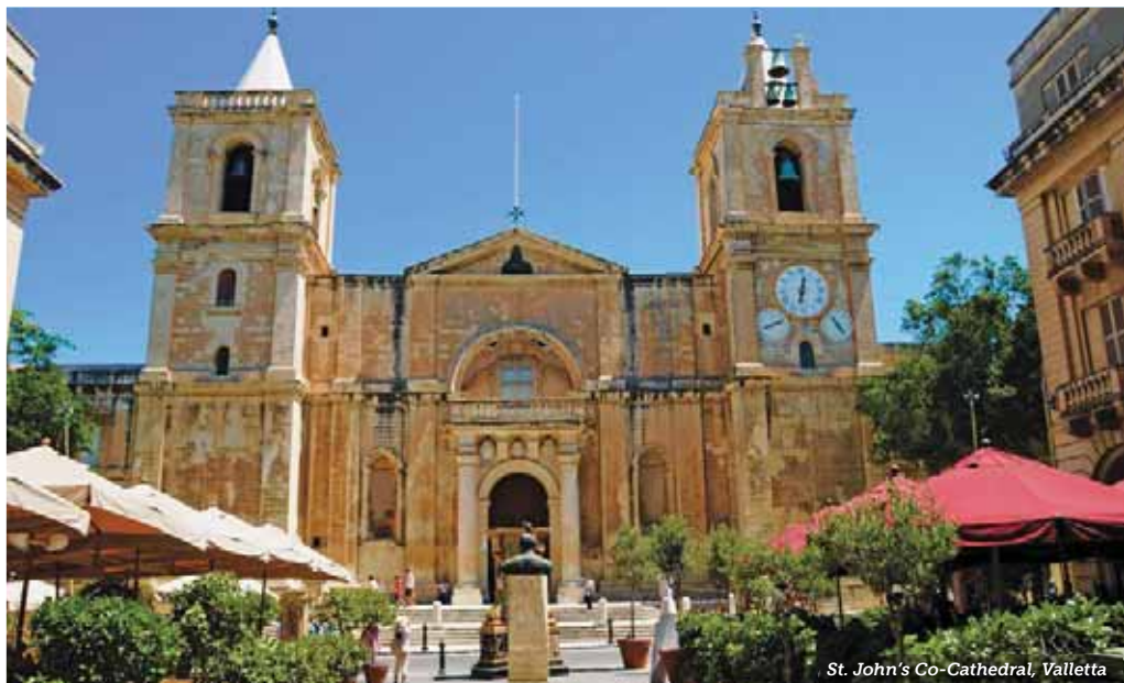
St. John's Co-Cathedral, Valletta