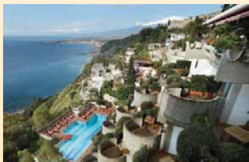
Eurostars Monte Tauro | Taormina