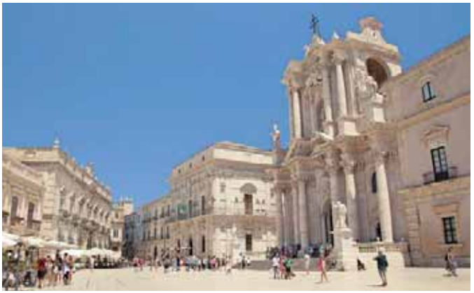
Piazza del Duomo, Ortygia