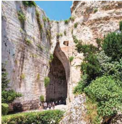
Ear of Dionysius, Neapolis Archaeological Park, Syracuse

Syracuse. Take in the Greek theater and the Roman amphitheater of this influential ancient Mediterranean city, then explore Latomia del Paradiso, a former limestone quarry, and the Ear of Dionysius, famed for its acoustics. After a stop to view Caravaggio's "The Burial of St. Lucy" at the Basilica Santa Lucia, walk along the picturesque lanes of Ortygia, Syracuse's island old town, a UNESCO World Heritage