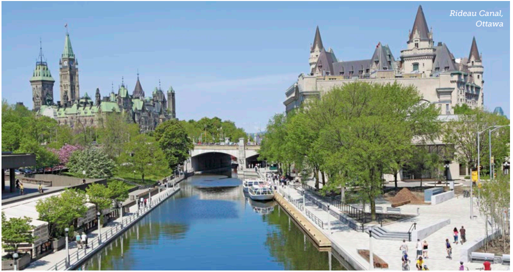
Rideau Canal, Ottawa