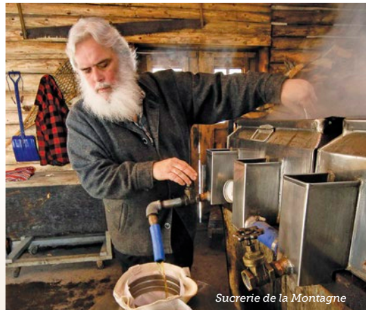
Sucrierie de la Montagne

Old Montreal Walking Tour. Canada's second-largest city was founded in 1642 by a group of French Catholics on an island where the St. Lawrence and Ottawa rivers converge. Today, Montreal is one of North America's most cosmopolitan cities, fiercely proud of its French heritage and imbued with a charismatic blend of Old-World ambience and modernity. Stroll to see the Place d'Armes, dominated by the