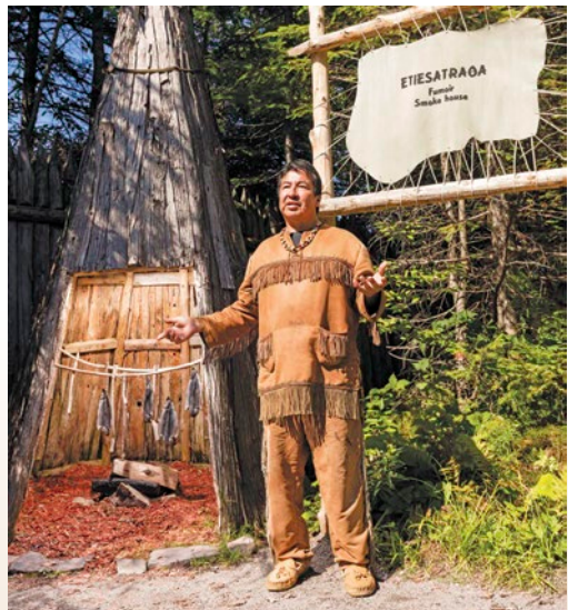
Traditional Huron Site, Wendake Huron reserve