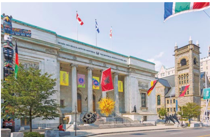
Montreal Museum of Fine Arts campus (Bourgie Hall at right)