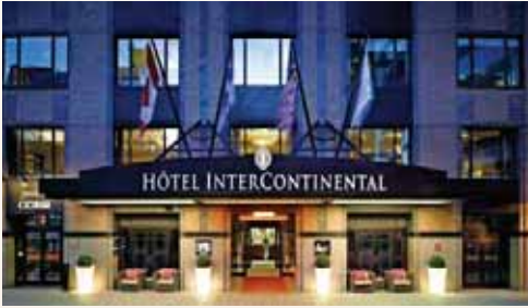
InterContinental Montreal | Montreal