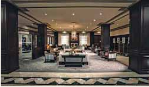
Lord Elgin Hotel | Ottawa