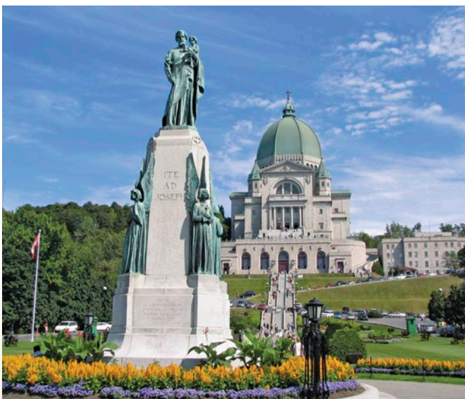
St. Joseph's Oratory, Montreal