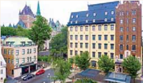
Clarendon Hotel | Québec City