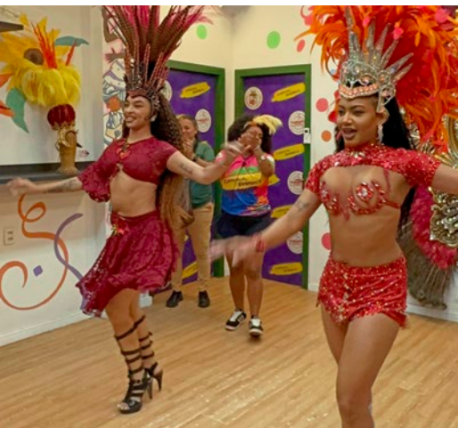
Samba school, Rio

Free Time: Enjoy an afternoon at leisure.