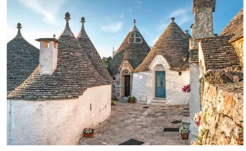
Top: Polignano a Mare | Above: Trullo