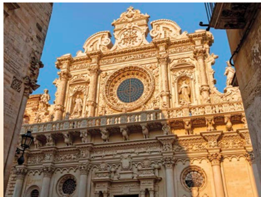
Basilica di Santa Croce, Lecce

Enrichment: History & Architecture of Lecce & Ostuni. Learn about this region's fascinating history and unique architectural styles.