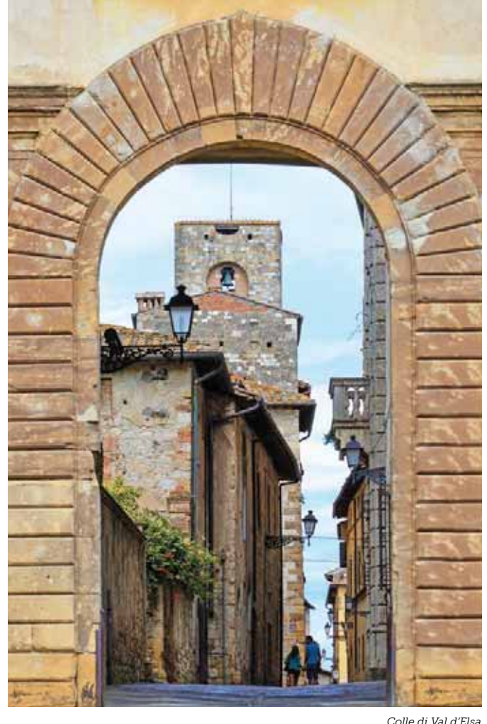
Colle di Val d'Elsa