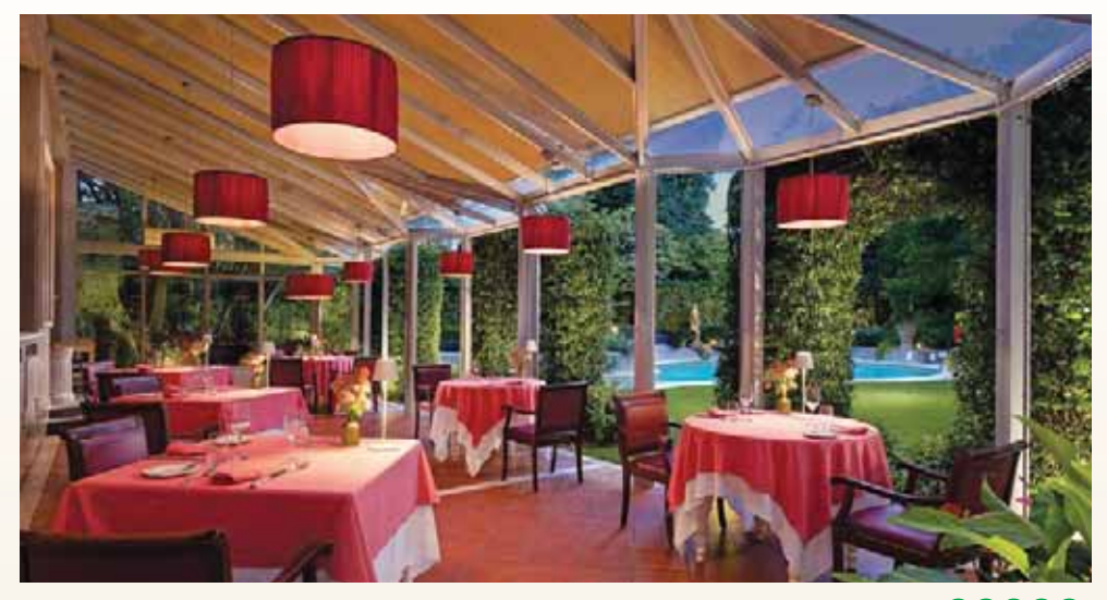
Sina Villa Medici | Florence