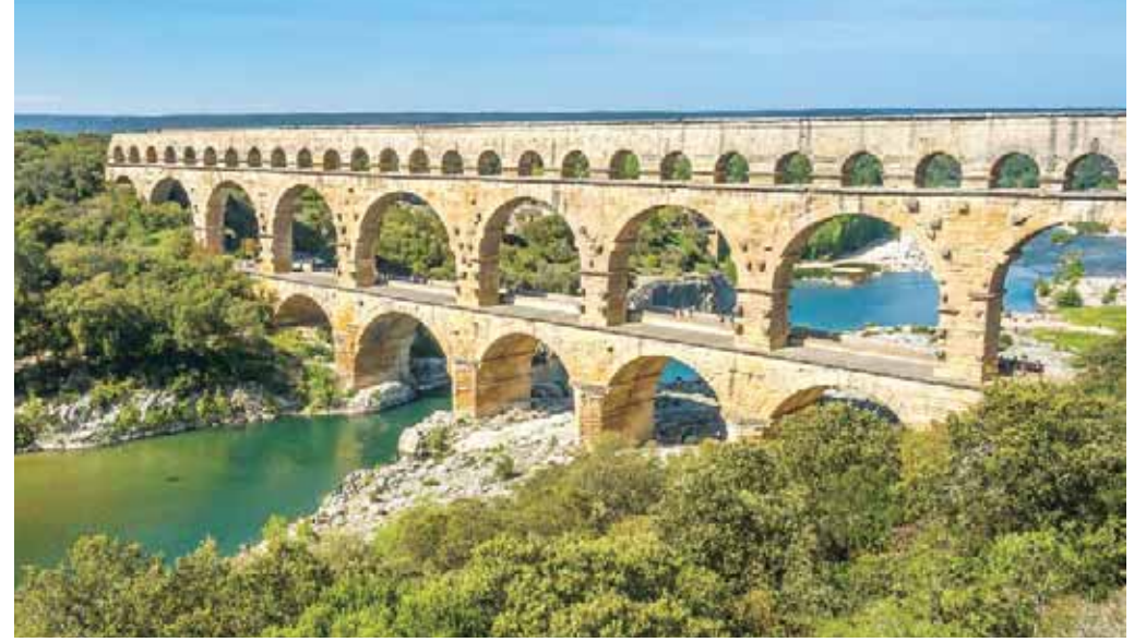
Pont du Gard