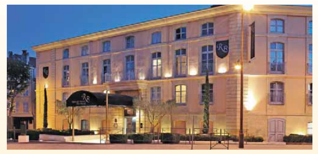
Grand Hôtel ROI Rene Aix-en-Provence Ctr-MGallery