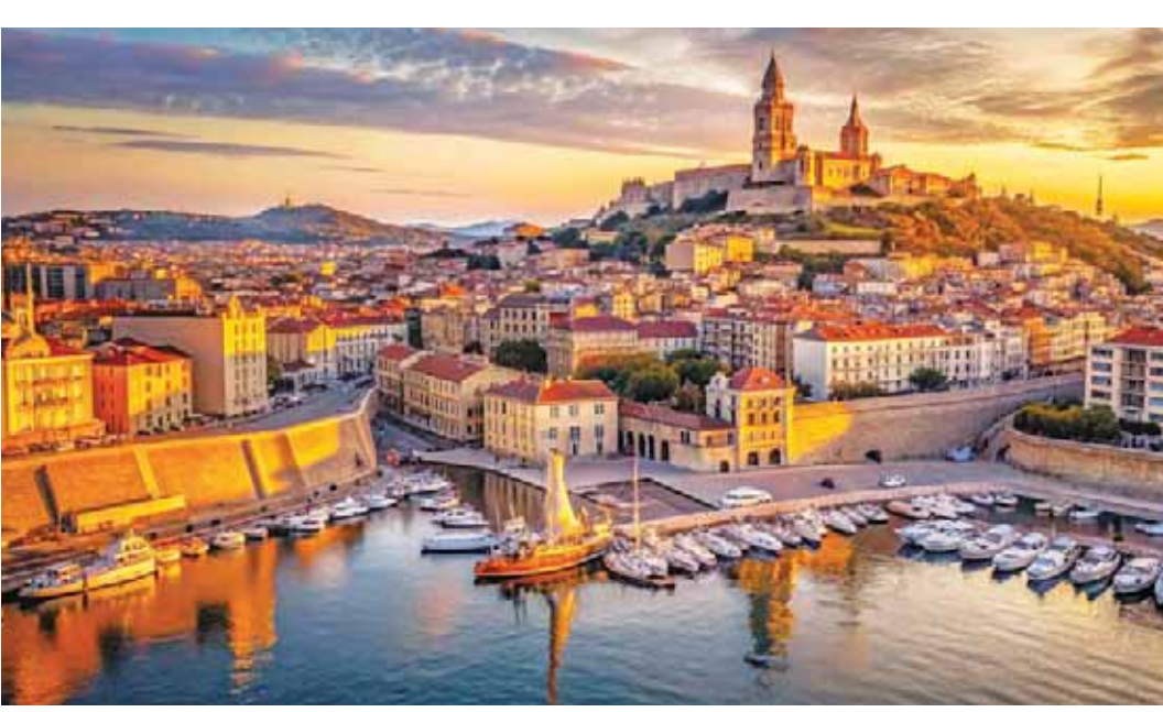
Notre-Dame de la Garde basilica perched above the port of Marseille