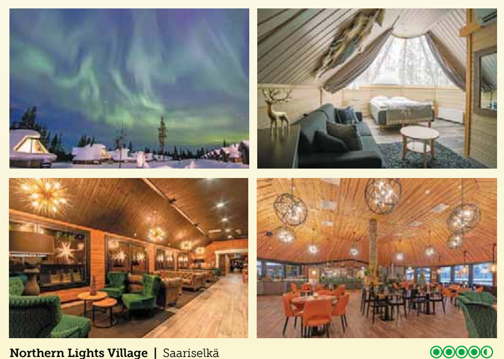
Northern Lights Village | Saariselkä