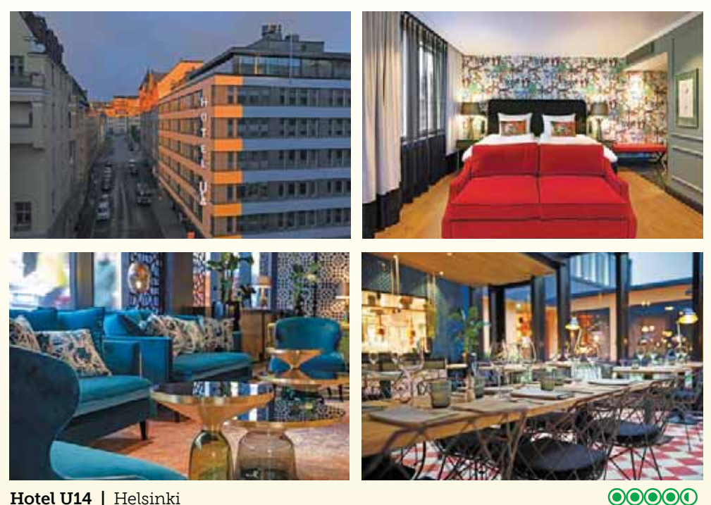
Hotel U14 | Helsinki