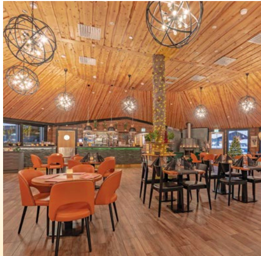
Dining room, Northern Lights Village