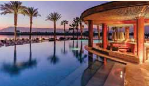
Hilton Luxor Resort & Spa | Luxor