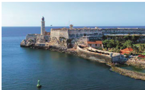
La Cabaña fortress, Havana harbor