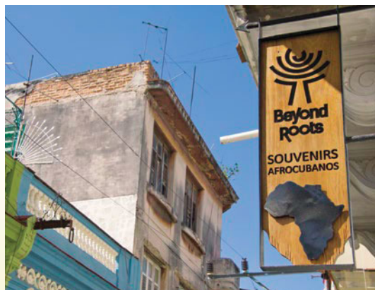
Beyond Roots, Havana

Jewish Culture & Cuban Dance. Visit the Ashkenazi Community Center to learn about Cuba's Jewish culture. Then, stop at Malpaso,