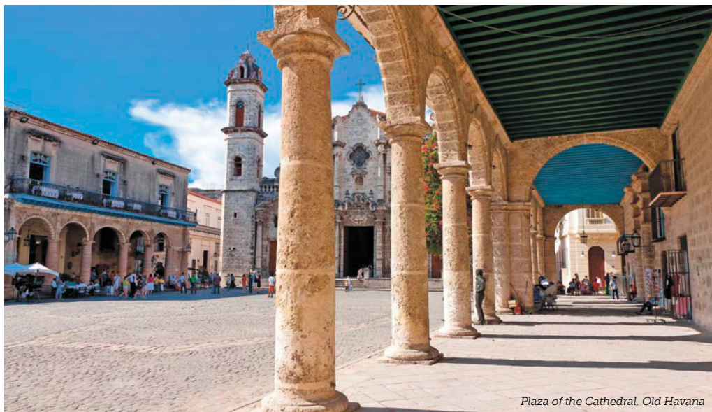
Plaza of the Cathedral, Old Havana