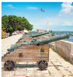
Cannons at fortification, Havana