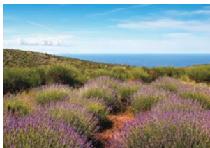
Lavender farm, Hvar