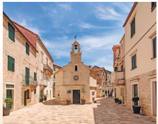
Stari Grad, Hvar

Vrboska & Winery. Learn about the local viticulture at a family winery and enjoy a guided tasting of the family's legendary wines. Continue to the fishing town of Vrboska with fig-covered courtyards and pretty alleyways.