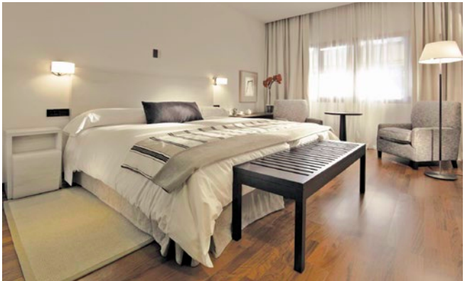
Real Alcázar, Sevilla