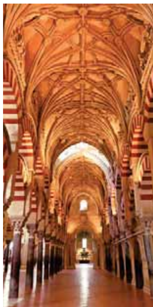
La Mezquita, Córdoba

Knowledgeable Lecturers deepen your appreciation for the region and its history, culture and current events.