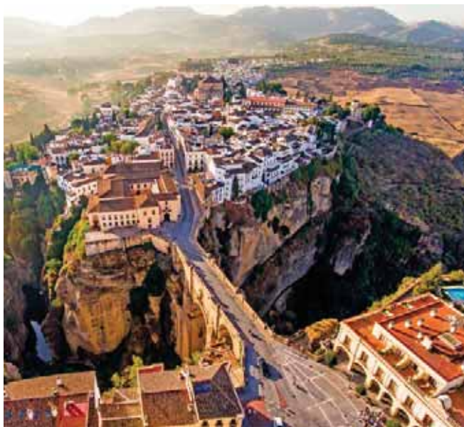
El Tajo Gorge, Ronda