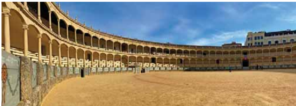
Plaza de Toros, Ronda