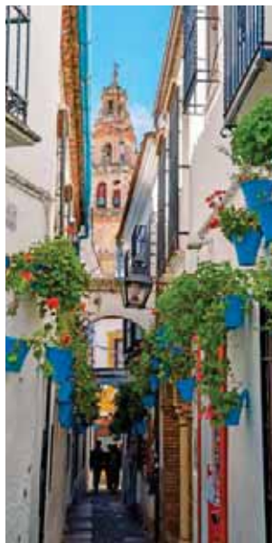
Jewish Quarter, Córdoba