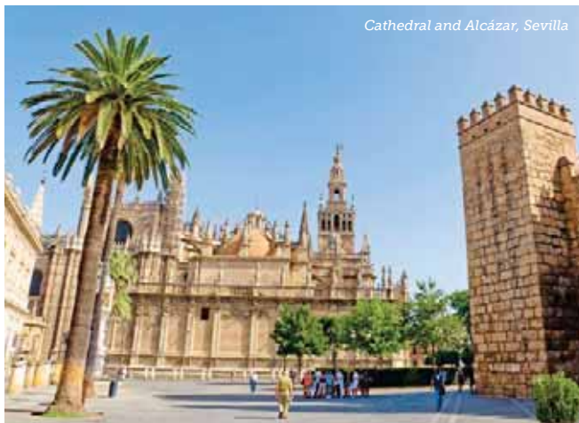
Cathedral and Alcázar, Sevilla