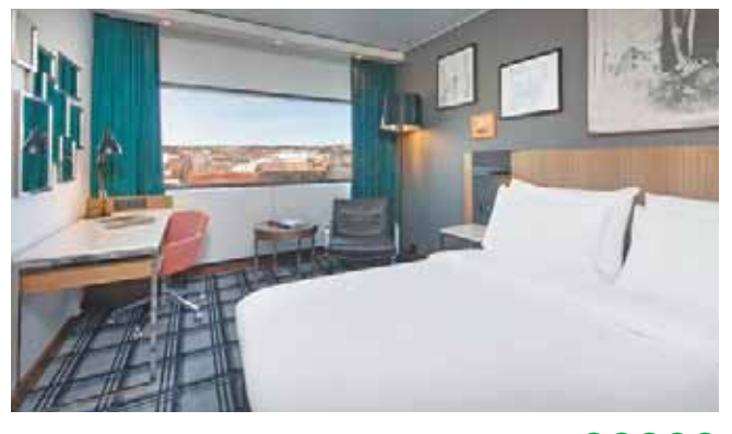
Radisson Blu Scandinavia Hotel | Oslo