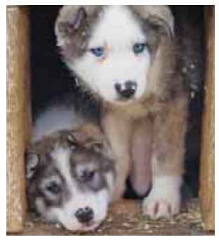
Husky puppies, Tromsø