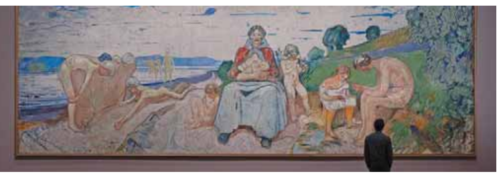
MUNCH Museum, Oslo