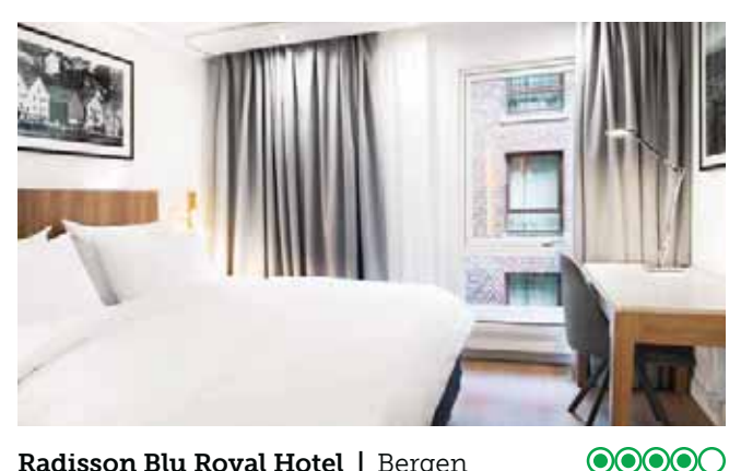
Radisson Blu Royal Hotel | Bergen