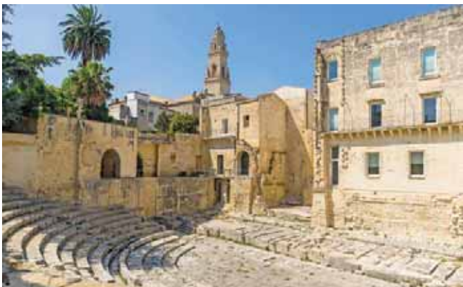
Ruins of a Roman amphitheater, Lecce