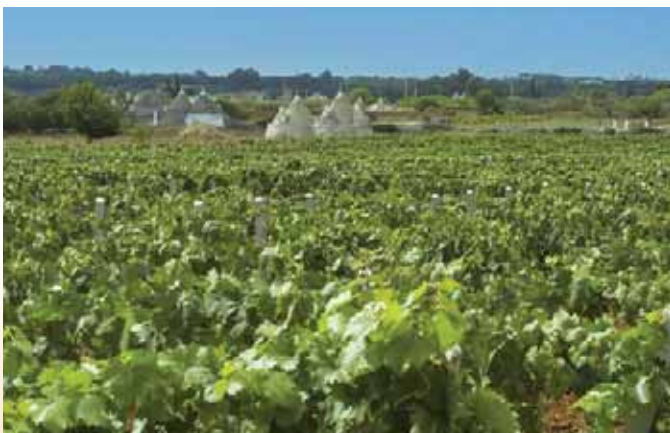
Vineyards and trulli in the countryside near Alberobello