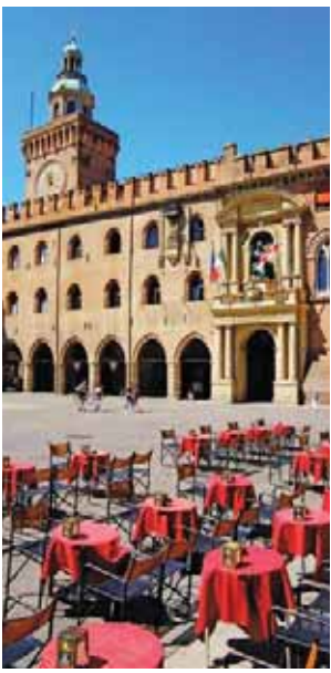
Piazza Maggiore, Bologna