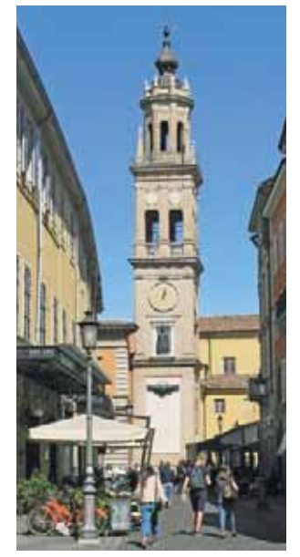
Clock tower, Parma