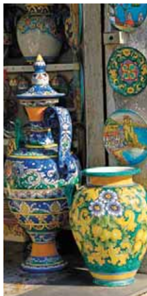
Pottery, Vietri sul Mare

Knowledgeable Lecturers deepen your appreciation for the region and its history, culture and current events.