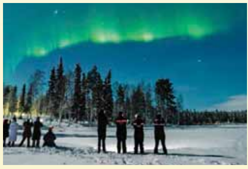
Northern Lights Village | Pyhä