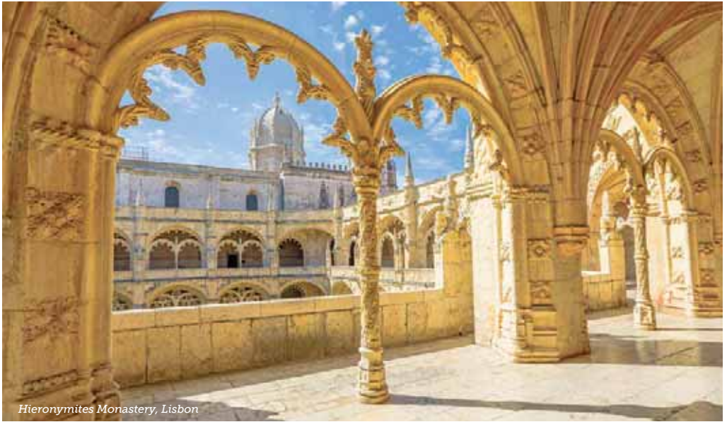
Hieronymites Monastery, Lisbon