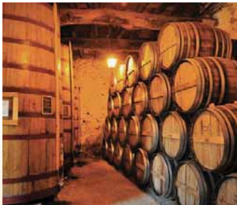
Port wine cellar

on a route with a beautiful view of Porto and Ribeira Square. Continue to a port wine cellar for a tasting. (Active)