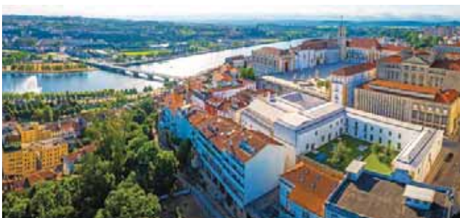
University of Coimbra