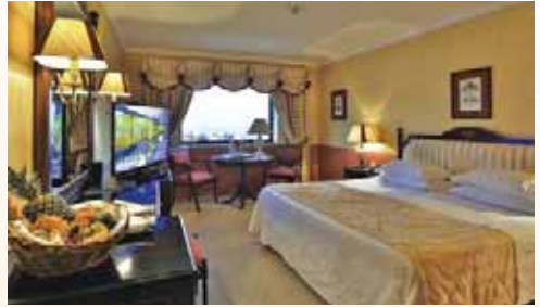
Dom Pedro Lisboa | Lisbon