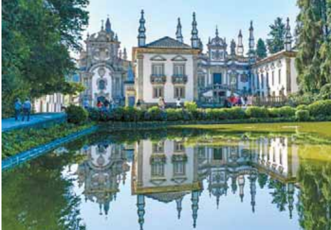
Manor Solar de Mateus