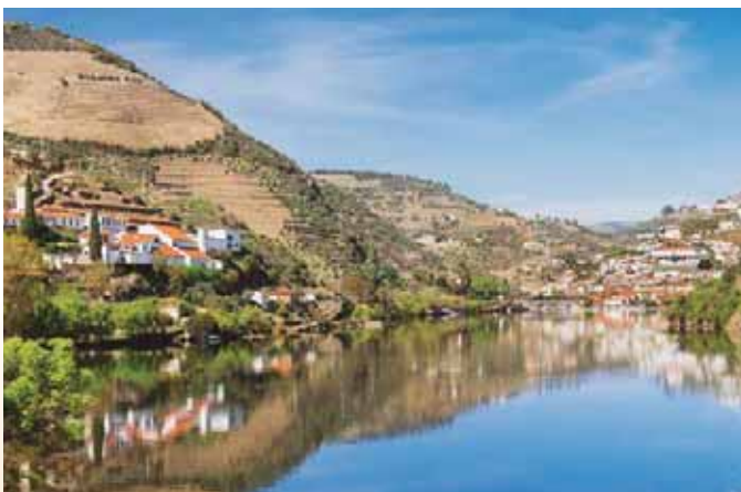
Douro River near Pinhão