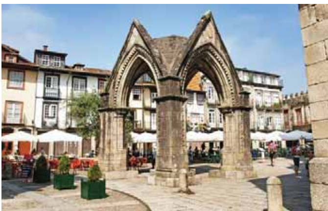
Old Town, Guimarães