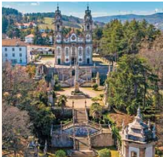
Nossa Senhora dos Remédios, Lamego