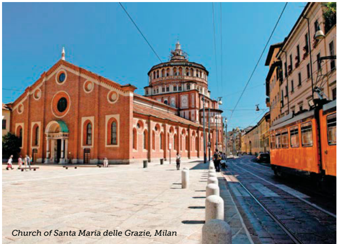
Church of Santa Maria delle Grazie, Milan