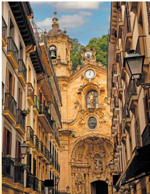
Basilica de Santa María del Coro, San Sebastián