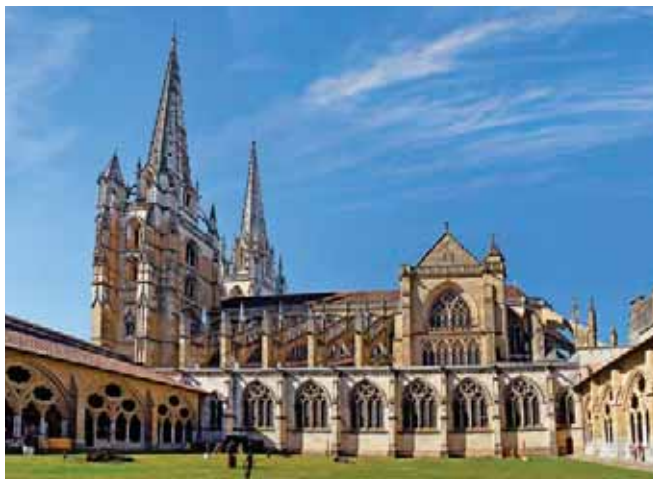
Right: Sainte-Marie Cathedral