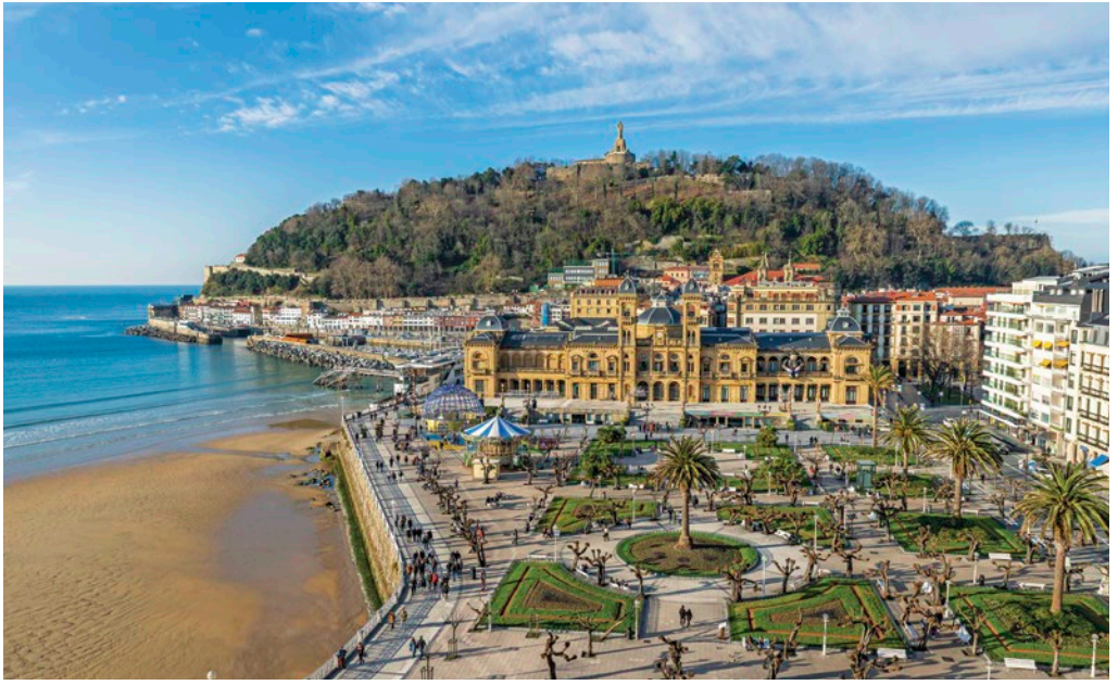
Promenade, San Sebastián