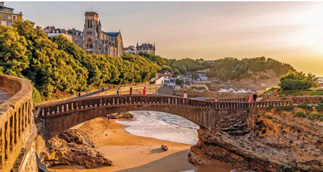
St. Eugénie Church, Biarritz

outcrop for sweeping coastal views. Visit the old fishing port and the medieval watchtower.