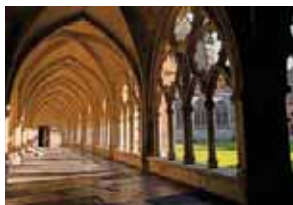
Above: Cloister of Sainte-Marie Cathedral, Bayonne