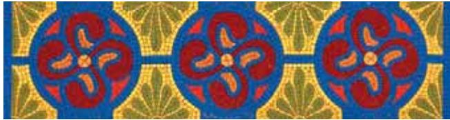
Basque cross mosaic