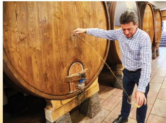
Basque cider cask

Biarritz. This chic seaside town has been a popular resort since the 1850s. Take a guided walk from St. Eugénie Church and continue along the waterfront to the Rocher de la Vierge