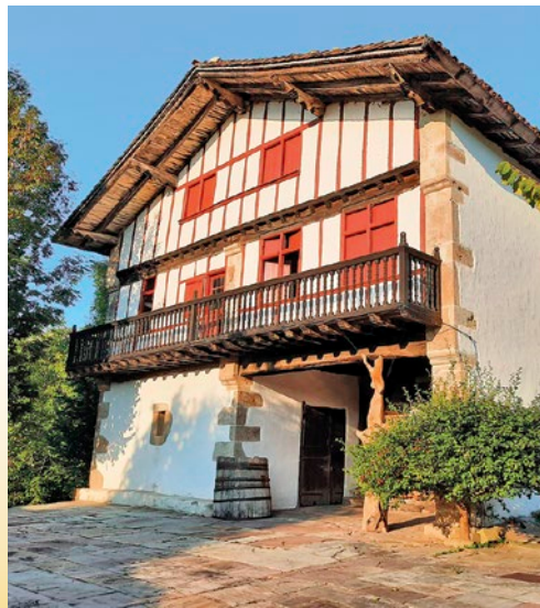
Maison Ortilloplitz, Sare

a restored, 16th-century farmhouse in Sare, and learn about the everyday customs of French Basque families. Later, stroll through colorful Espelette, famous for its red peppers, and pause for lunch in town. First brought to the area in 1650 by a local sailor, the peppers are integral to Basque cooking and officially protected as a regional product.