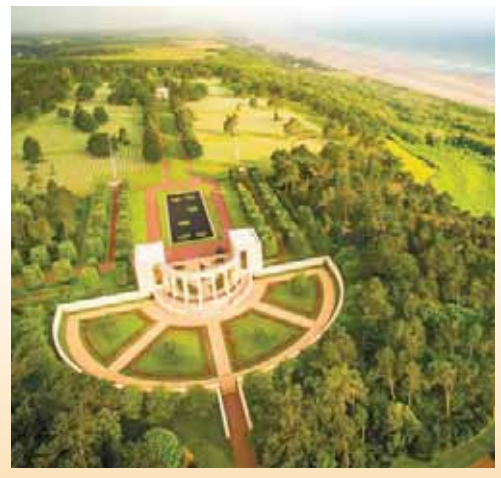
Normandy American Cemetery

Normandy & D-Day. Journey into World War II history at Pointe du Hoc. It was here that U.S. Rangers scaled cliffs to destroy German artillery emplacements that posed a threat to troops landing on Omaha and Utah beaches. Learn about this treacherous mission from your guide. At Omaha Beach, contemplate the bravery of the Allied landing forces who advanced under devastating fire across the heavily fortified shoreline to overcome German troops. Next, visit the Normandy American Cemetery, which contains 9,385 graves of Americans who died in the invasion and subsequent battles, followed by a touching visit to the Caen Peace Memorial Museum.