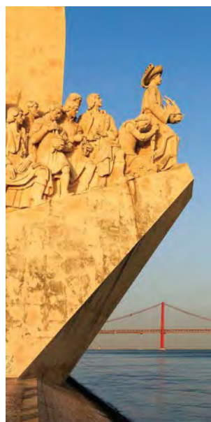
Monument to the Discoveries, Lisbon

Knowledgeable Lecturers deepen your appreciation for the region and its history, culture and current events.