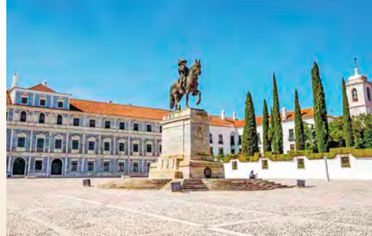
Ducal Palace, Vila Viçosa

Monsaraz. Take in the medieval atmosphere of this picturesque, hilltop village and sweeping countryside views during a guided stroll. Next, travel to Herdade do Esporão, a family-owned business on a large estate. Learn how their olive oil is made on a tour, take part in a unique