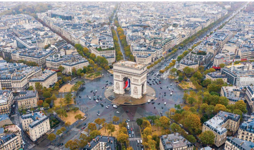
Champs-Élysées leading to the Arc de Triomphe

Elective | Versailles. Travel to France's grandest palace, a baroque chateau that was once the kingdom's political capital and the seat of the royal court. Walk in the footsteps of kings, queens and courtiers while visiting the palace and its gardens. Delight in ornate ceilings, rich tapestries and lavish galleries, and see the Hall of Mirrors, the room where the Treaty of Versailles was signed.