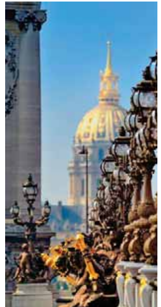
Pont Alexandre III

Knowledgeable Lecturers deepen your appreciation for the region and its history, culture and current events.