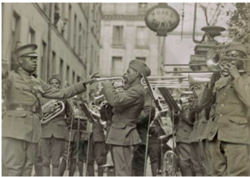
369th Infantry Regiment

Your next adventure begins in chic Paris! This unique program reveals the critical role that the French capital played in African American history. From the banks of the Seine River to storied landmarks and beyond, follow in the footsteps of prominent Black musicians, writers and luminaries and understand how African Americans helped shape the identity of this magical city!