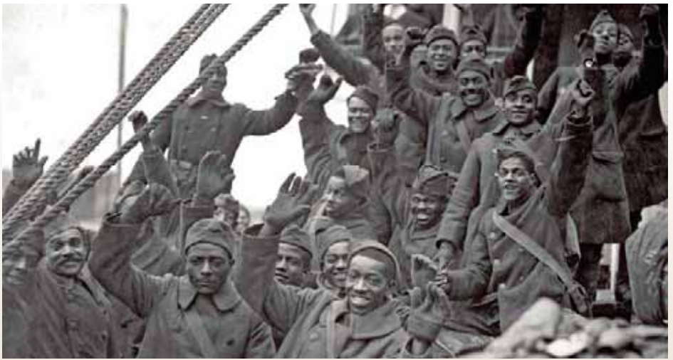
369th Infantry Regiment