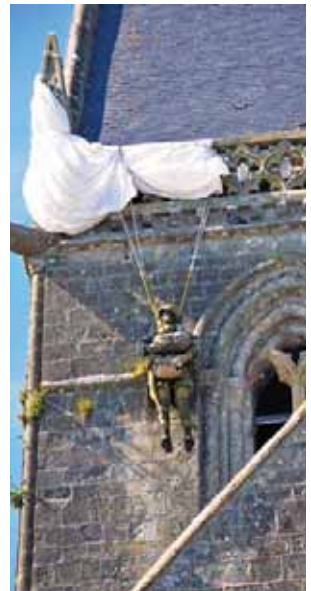
Private John Steele Monument, Sainte-Mère-Église

Knowledgeable Lecturers deepen your appreciation for the region and its history, culture and current events.