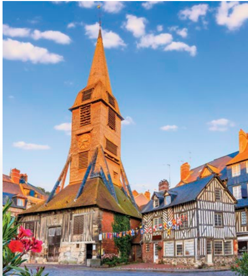
Church of Sainte Catherine, Honfleur

Free Time: Select a special place for dinner. Your Travel Director can assist with planning.