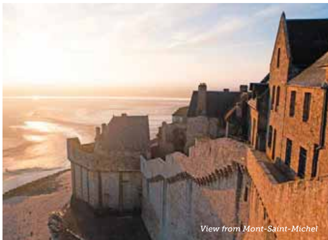
View from Mont-Saint-Michel