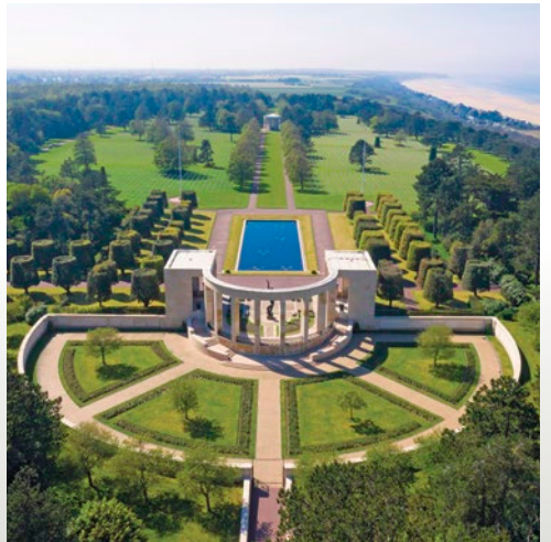
Normandy American Cemetery

D-Day and the Battle of Normandy. Begin in Arromanches, where you'll see the site of an offshore mulberry harbor and visit the museum there. These floating harbors enabled the Allies to funnel enormous resources into France to wage war against Hitler. Afterward, walk along Omaha Beach, see the memorial and reflect upon the exceptional courage of the Allied landing forces, who valiantly advanced under devastating fire across the heavily fortified