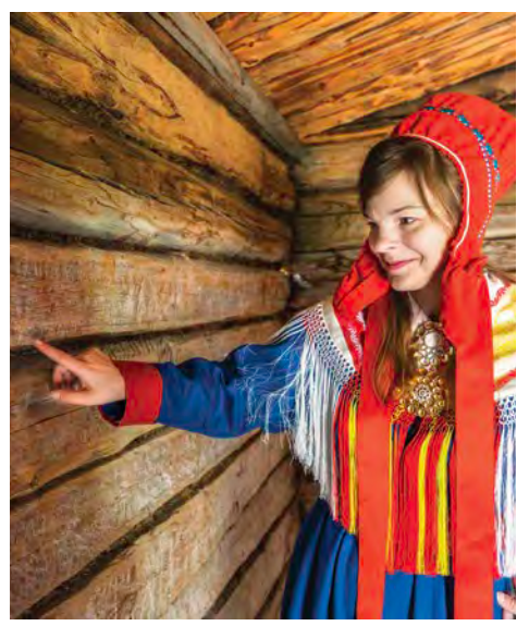
Sámi woman, Sámi Museum Siida

every second night in northern Lapland. weather permitting. Savor a refreshing break by a fire, complemented by toasty beverages, snacks and tales about the Northern Lights.