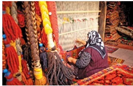
Local woman weaving

mountain village and learn about enduring traditions like carpet and kilim weaving.