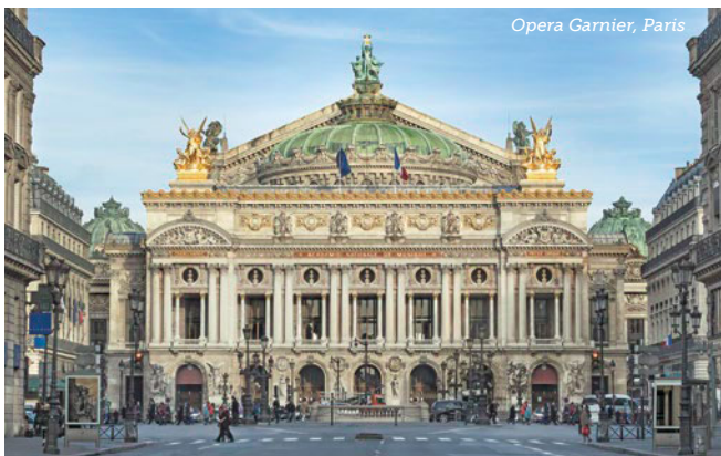
Opera Garnier, Paris