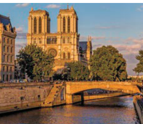
Notre Dame, Paris