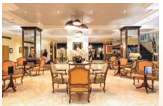
Dom Pedro Lisboa | Lisbon