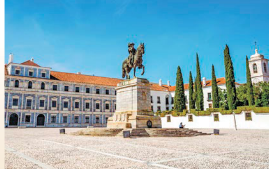
Ducal Palace, Vila Viçosa

Monsaraz. Take in the medieval atmosphere of this picturesque, hilltop village and sweeping countryside views during a guided stroll. Next, travel to Herdade do Esporão, a family-owned business on a large estate. Learn how their olive oil is made on a tour, take part in a unique