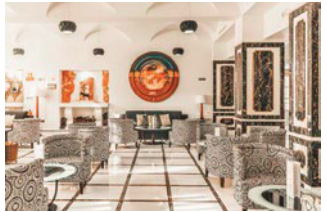
Alentejo Marmoris Hotel & Spa | Vila Viçosa