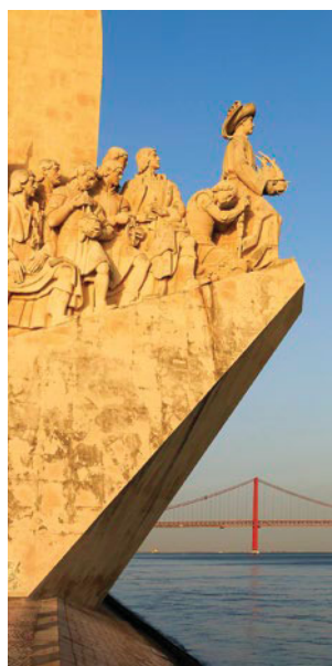
Monument to the Discoveries, Lisbon

Knowledgeable Lecturers deepen your appreciation for the region and its history, culture and current events.