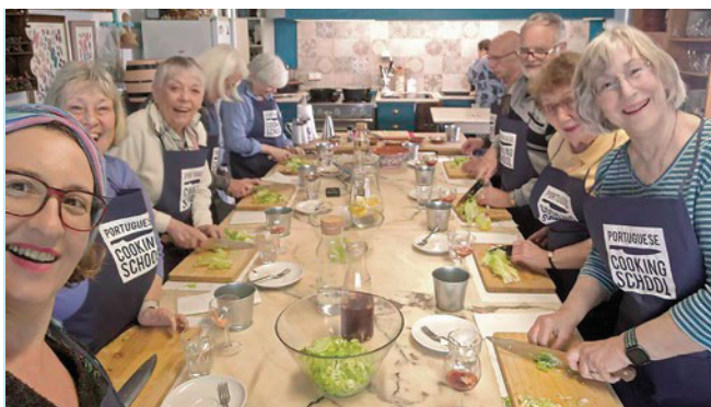
Cooking at Sofia's farmhouse near Évora