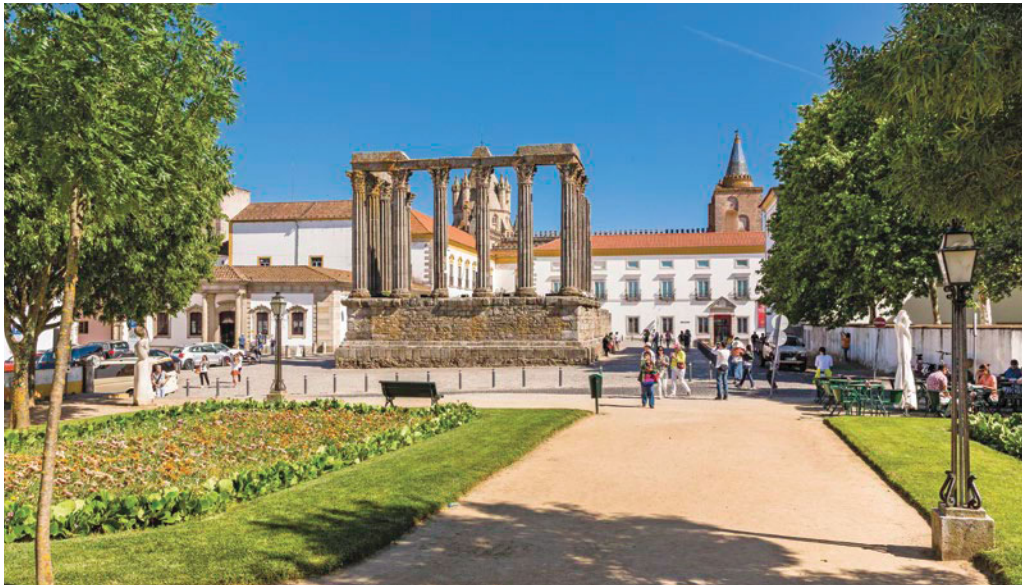
Temple of Diana, Évora