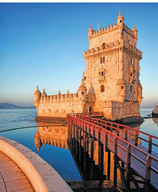
Tower of Belém, Lisbon