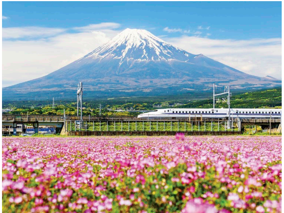
Shinkansen passing Mt. Fuji

Tokyo. Drive through the chic, stylish Ginza shopping district. Witness Tokyo Skytree, the world's tallest building. Visit the colorful, Buddhist Asakusa Kannon Temple. Explore the Imperial Palace's exquisite gardens.