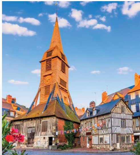
Church of Sainte Catherine, Honfleur

Free Time: Select a special place for dinner. Your Travel Director can assist with planning.