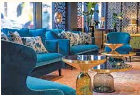
Hotel U14 | Helsinki