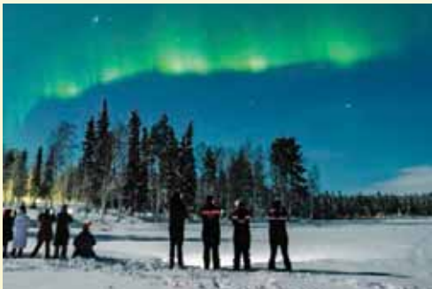
Northern Lights Village | Pyhä