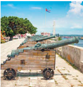
Cannons at fortification, Havana