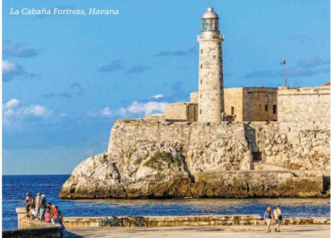
La Cabaña Fortress, Havana