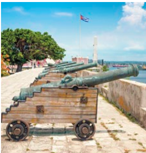
Cannons at fortification, Havana