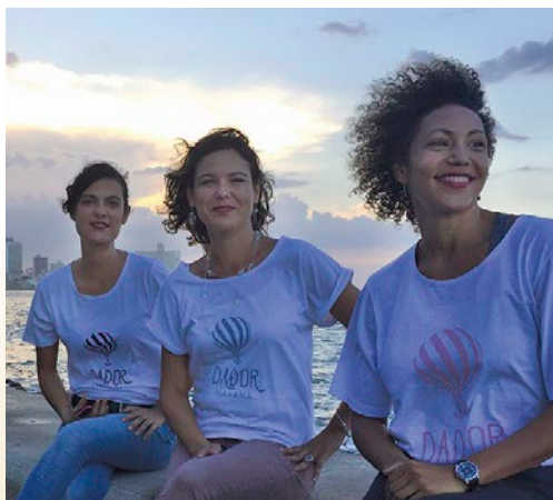
Founders and owners of Dador

Later today, visit the Ludwig Foundation, a nonprofit cultural institution that is dedicated to protecting and promoting Cuban artists.