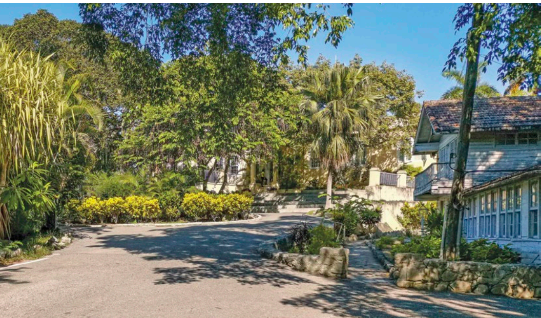
La Finca Vigia museum, Ernest Hemingway's home

Meet independent local artists and learn about their desires to pursue artistic ventures. Sit down to dinner at the Hotel Nacional.