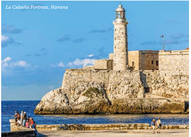
La Cabaña Fortress, Havana