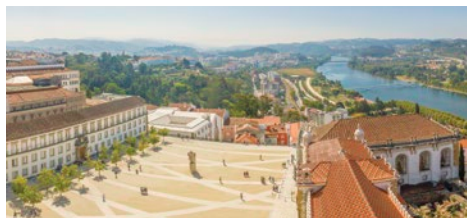
University of Coimbra