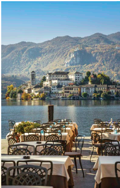
View of Isola San Giulio, Lake Orta