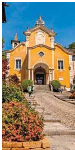
Orta San Giulio

Knowledgeable Lecturers deepen your appreciation for the region and its history, culture and current events.