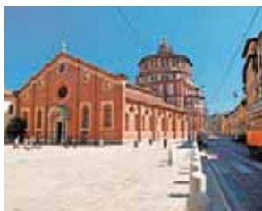
Santa Maria delle Grazie

Church and Dominican Convent of Santa Maria delle Grazie with "The Last Supper" by Leonardo da Vinci