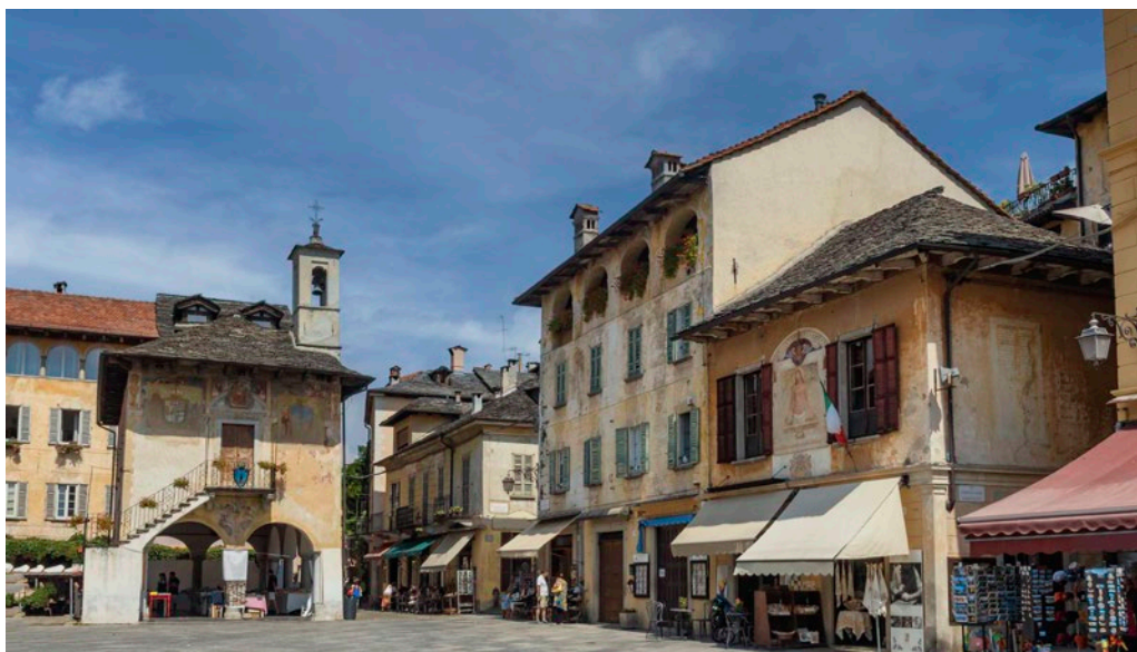
Orta San Giulio