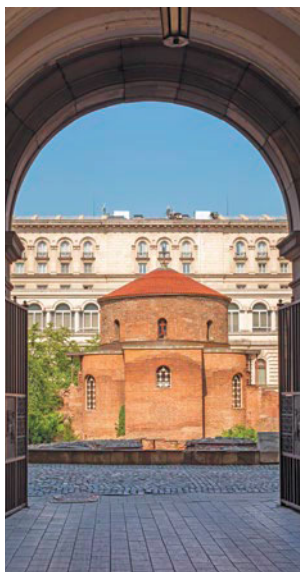
St. George Rotunda, Sofia