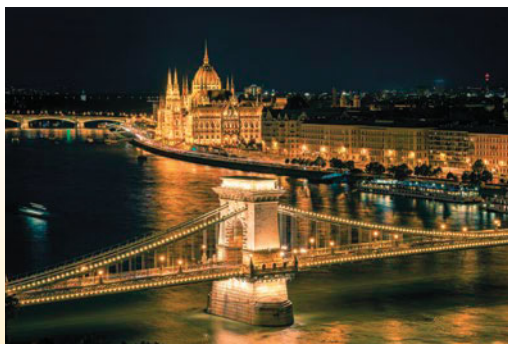
Budapest at night