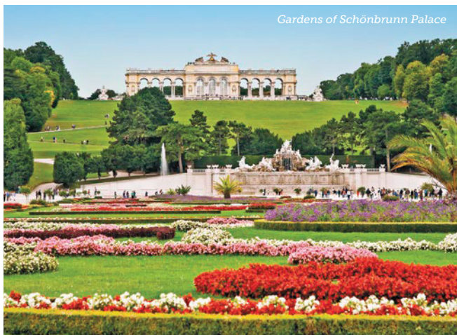
Gardens of Schönbrunn Palace