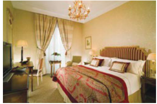
Sofia Hotel Balkan | Sofia, Bulgaria