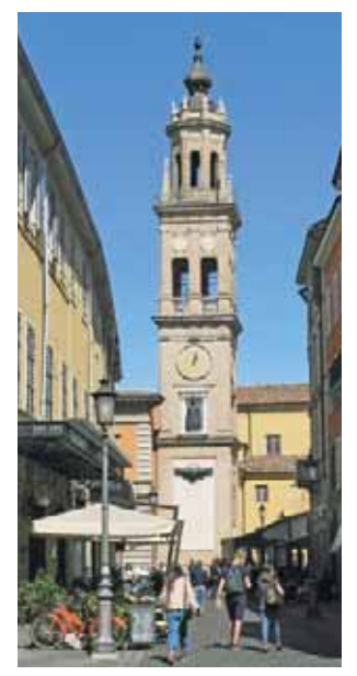
Clock tower, Parma