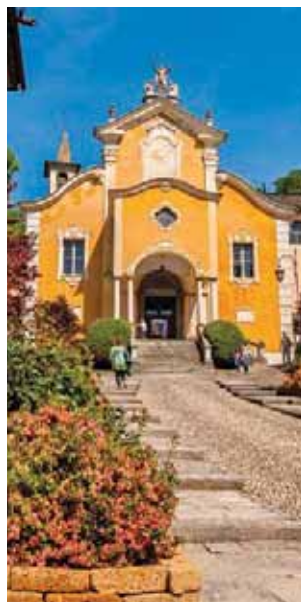
Orta San Giulio

Knowledgeable Lecturers deepen your appreciation for the region and its history, culture and current events.