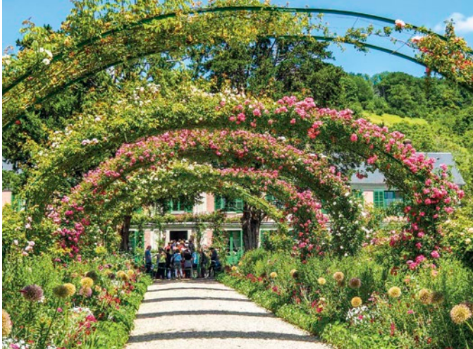
Home and gardens of Monet, Giverny