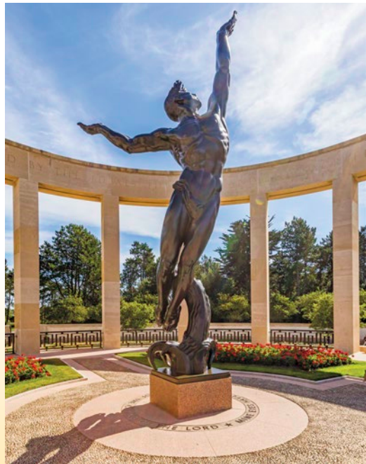
Monument, Normandy American Cemetery

Monet, His Life in Giverny. Visit the visionary impressionist's Giverny house. See the studio where he created his "Water Lilies" series, and