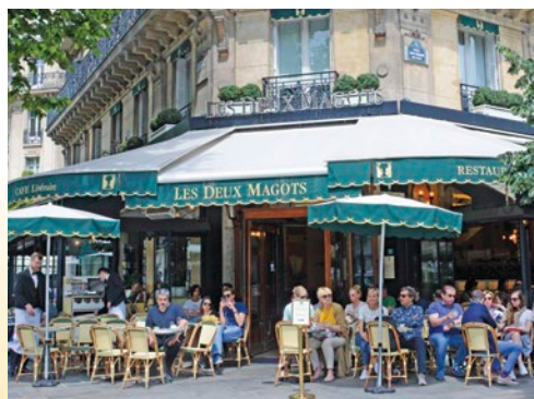
Café, Latin Quarter, Paris

Normandy & D-Day. Immerse yourself in World War II history on a guided tour. Begin at Pointe du Hoc to hear the story of the U.S.