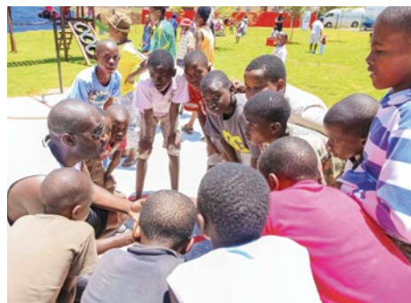
Youth of Soweto