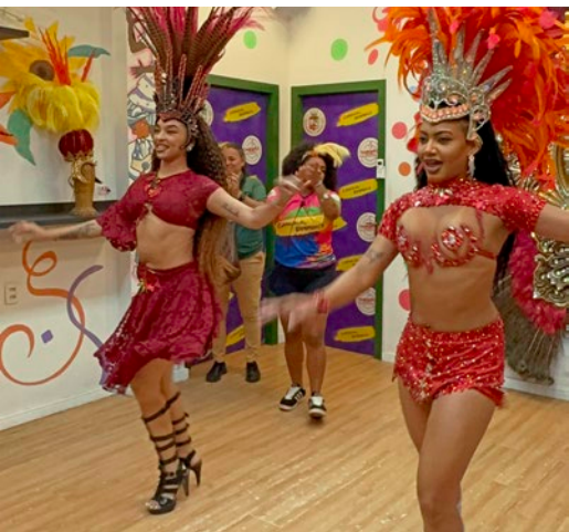
Samba school, Rio

Free Time: Enjoy an afternoon at leisure.