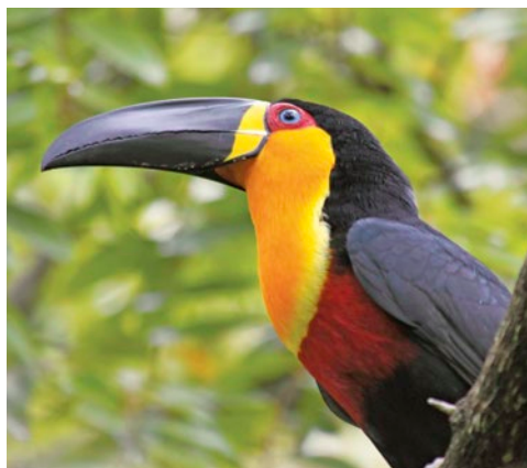
Toucan, Carioca Landscape