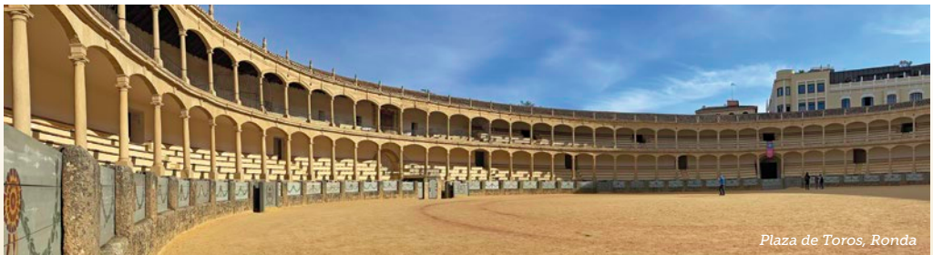
Plaza de Toros, Ronda

Sevilla City Tour. Journey to the cultural heart of southern Spain on a panoramic/walking tour. See the centuries-old bullring and the Moorish watchtower near the river. Enjoy a stop at the remarkable Plaza de España to see its canal and tiled alcoves representing the provinces of Spain. Next, tour the grand Real Alcázar, a medieval Moorish palace still in use today as a royal residence, and the stunning Cathedral of Sevilla, the world's largest Gothic church. These structures stand in the heart of Sevilla as proud representation of the Spanish Golden Age.