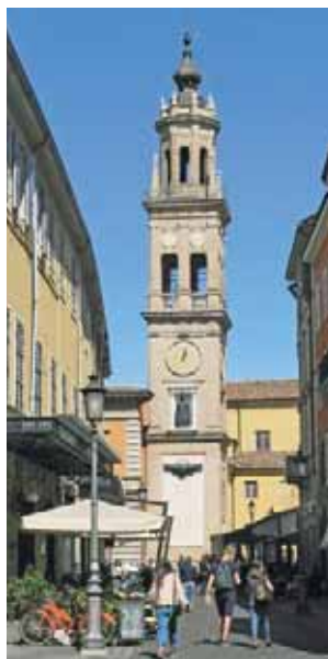
Clock tower, Parma

Knowledgeable Lecturers deepen your appreciation for the region and its history, culture and current events.