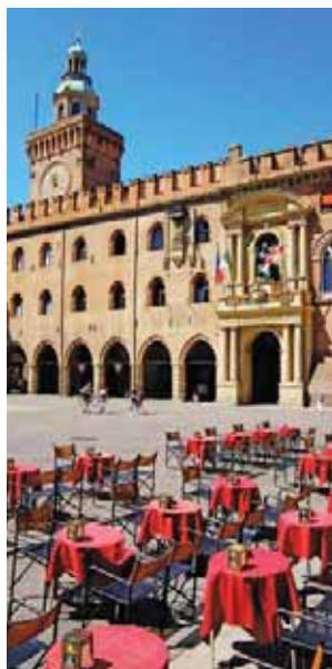
Piazza Maggiore, Bologna