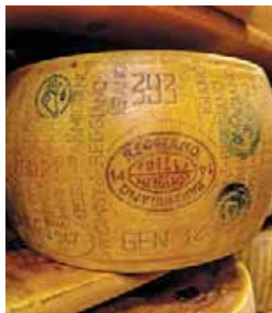
Parmesan cheese, Parma